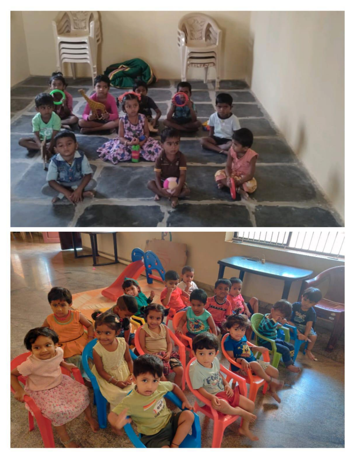
Appendix 3: Glimpses from the field visits